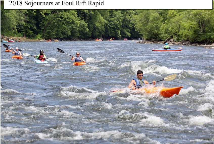
2018 Sojourners at Foul Rift Rapid